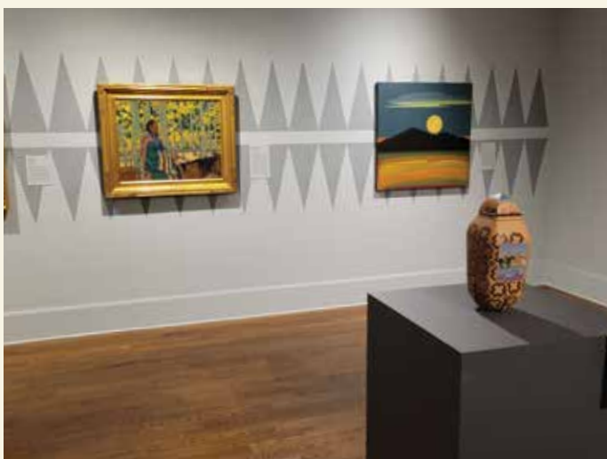
View of Painted: Our Bodies, Hearts, and Village .

Opening to rave reviews in May was Painted: Our Bodies, Hearts, and Village , a collection installation drawn largely from the Lunder Collection and its great strengths of art in the southwest United States. The exhibition puts in dialogue works from the Taos Society of Artists (TSA) with works by 20th and 21st century Native American artists, centering Pueblo perspectives on the context that informed the social and cultural landscape of Taos from 1915 to 1927, and shedding light on issues that affect Native people today, in the Southwest and beyond. The exhibition occasioned new research through the Lunder Institute for American Art, new acquisitions—including a commission—thanks to generous endowment support and art purchase funds, and the opportunity for Colby alumni to lend works from their